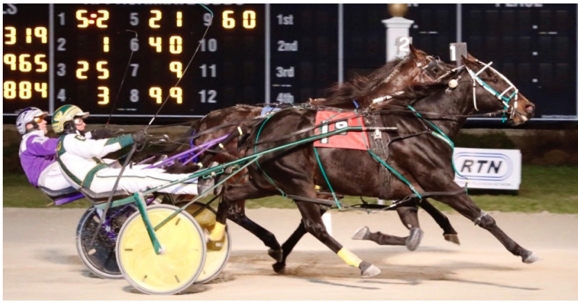
Fan Of Terror edges past I'm A Big Deal to win the Billy Hamm Memorial in 1:50.4 at Hollywood Dayton Raceway.