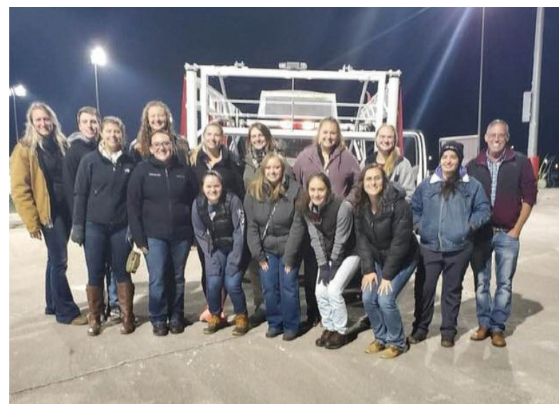
OSU College of Veterinary Medicine Equine Club spent the night at Dayton Raceway and visited with the horseman, track personnel and veterinarian to learn more about harness racing.