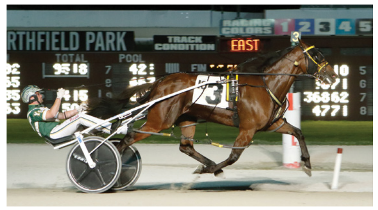
This Is The Plan

This Is The Plan etched himself into harness racing history books as the fastest horse to ever win on a half-mile track when he won the $200,000 Battle of Lake Erie in 1:47.3 at MGM Northfield Park June 5.