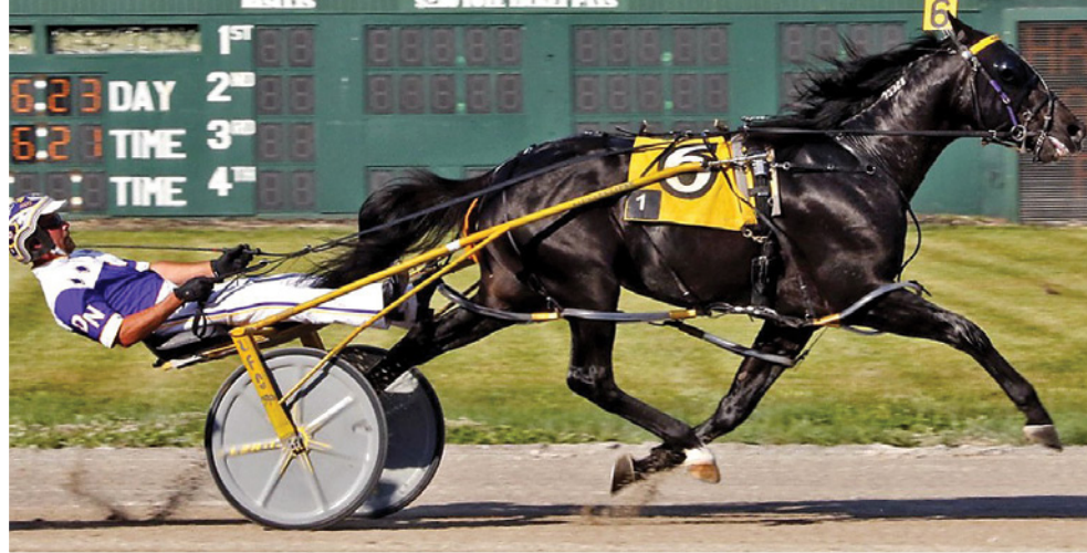
Heart of Chewbacca

"It's a lot of wins and I'm actually very proud to have reached 13,000," he said. "One day, I'll start looking back and reflecting on this and the names around me on that list. I haven't won a bunch of major stakes, but I'm just as happy winning a Non-Winners-of-$750-in-the-last-4. Every win means something to the sport, and it means something to the owners."