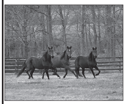
Hello Pilgrim in the center turned out for a short vacation with his two girlfriends.

Harness Horse Youth Foundation (HHYF) April 30 Christian Harness Horsemen's Association April 30