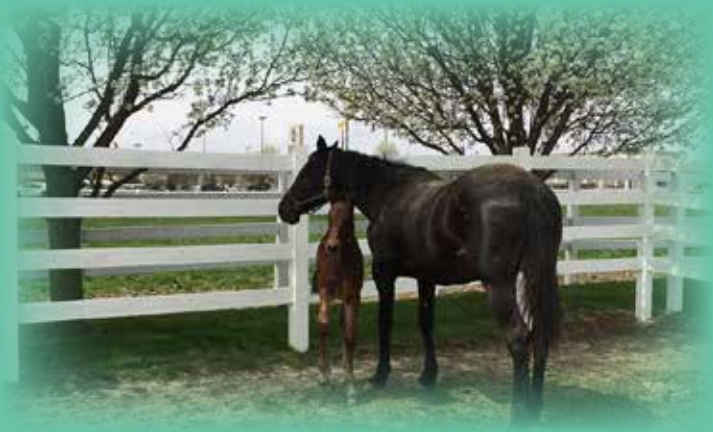
2017 Filly Captaintreacherous & Fox Valley Topaz Submitted by Lori Manke