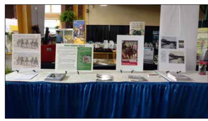
2017 Ohio State Fair Booth