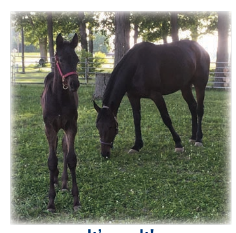
It's a colt! If I Can Dream - SomehowSomewhere Submitted by Macey O'Dell

Send your 2018 foal pictures to rmayhugh@ohha.com. Each month we will showcase one or more foals. Next month's photo could be yours!