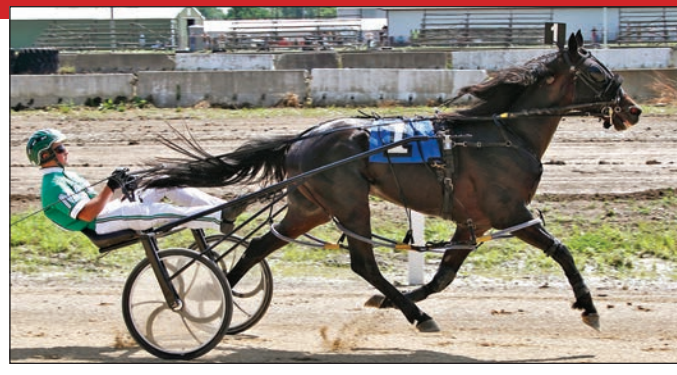
Long Train Runnin at Marion County Fair

To see the current standings of the Ohio Fair Racing Conference, visit the OHHA website https://www.ohha.com/ofrc.html.