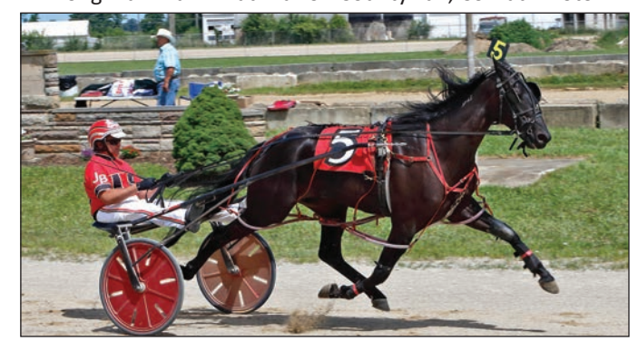
Kryptonite Rock at Madison County Fair