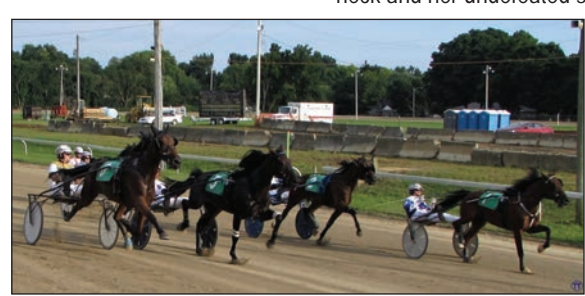
Greene County Fair.