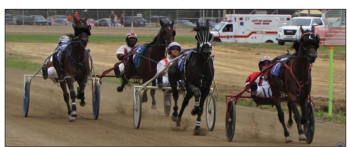
Preble County Fair.