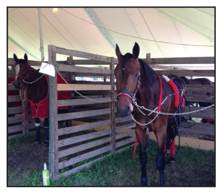
Paulding County Fair