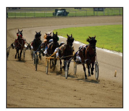
Pickaway County Fair