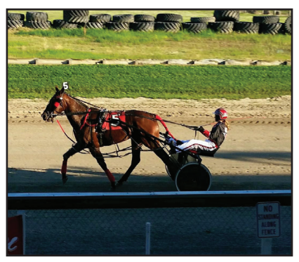
Putnam County Fair