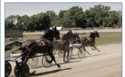
Cover photo: 2016 Pickaway County Fair.