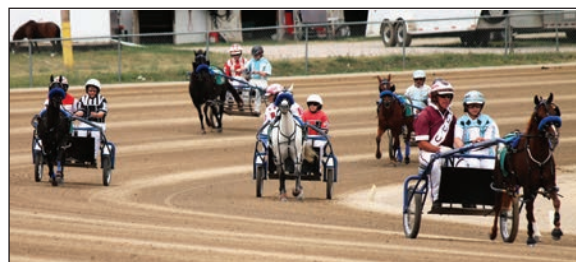
Horses and drivers headed to the gate for the exhibition race.