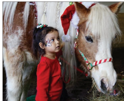
Rocky, the therapy horse.

By the end of 2017, PBJ Connections has provided more than 10,000 client hours to youth and families in Central Ohio, serving clients out of four locations including Otterbein University, The Ohio State University, and two private farms in Licking County. This was in the form of individual, group and family therapy following the EAGALA model of equine-assisted psychotherapy (EAP). Today PBJ Connections continues to serve Central Ohio and approximately 200 individuals per year at these four locations, using this model of therapy.