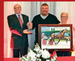
Rose Run Sydney, 3-Year-Old Trotting Filly of the Year was the 2017 Ohio Horse of the Year!

Join us to celebrate 2018 at the OHHA Annual Awards Banquet on Saturday, January 19 th at the Marriott Columbus University Area. The USTA District 1, OHHA member meeting and First Lady's Luncheon are also planned for January 19 th .