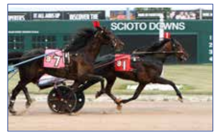
Cover photo: Like Old Times at the Ohio Breeders Stakes, photo by Conrad Photo