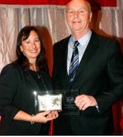
The Buckeye Harness Horseman | February 2016 27