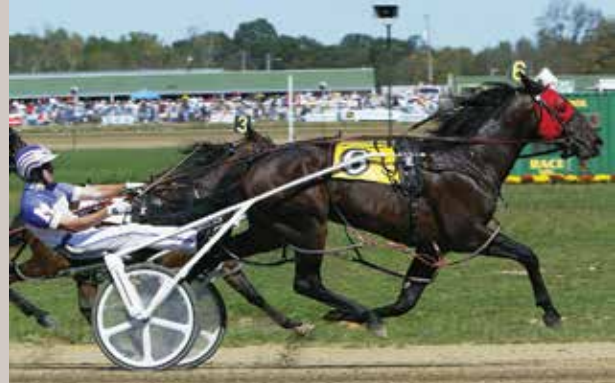
Stud Fee: $2,000

p,2, 1:54h; 3, 1:50.1f ($1,104,203) Mcardle - Anniecrombie - Abercrombie