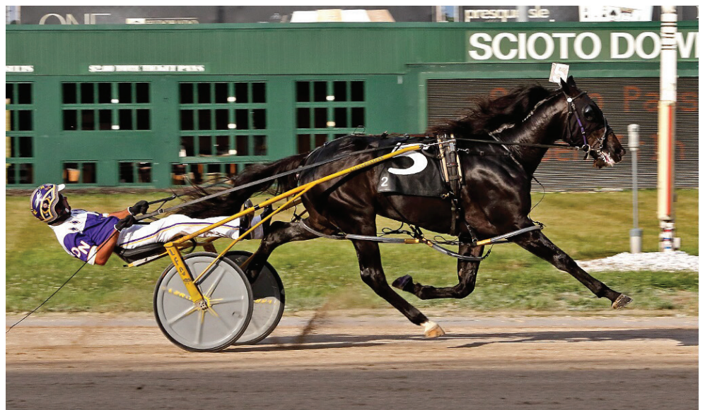
Heart of Chewbacca