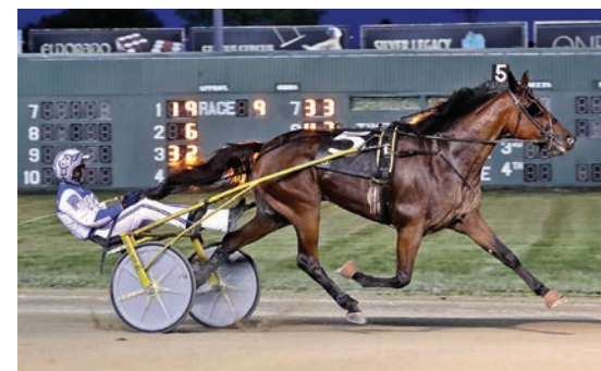
A Fancy Face