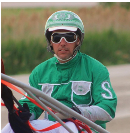
Kurt Sugg