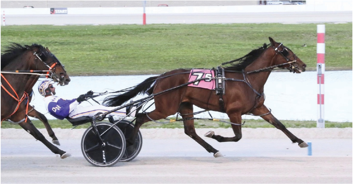
Prancing Queen

As the calendar turned to May, the first leg of the Buckeye Stallion Series got underway at Miami Valley Raceway. Three-year-old fillies took the stage May 1, while the colts hit the track on May 2 and 3. A total of 23 divisions went to the gate with each race featuring a purse of $17,500 for a total purse of $402,000 for the first leg.