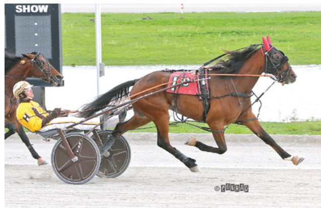
Doo Wop Kid

What the Blaze set fractions of :27, :57.1, and 1:25.4 only to see Doo Wop Kid make a move at the three-quarter pole and blow past the race leader.