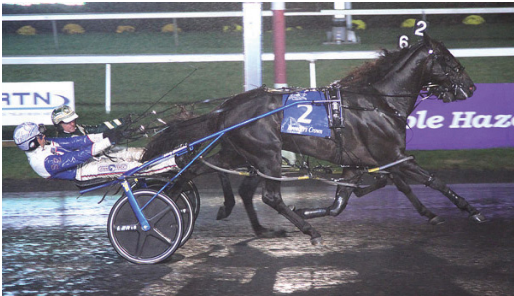
Monte Miki won the 2-Year-Old Colt Pacing Breeders Crown

Owned by Velocity Standardbreds, ‘Miki’ took his lifetime mark of 1:50.4 in a Breeders Crown Elimination at The Big M.