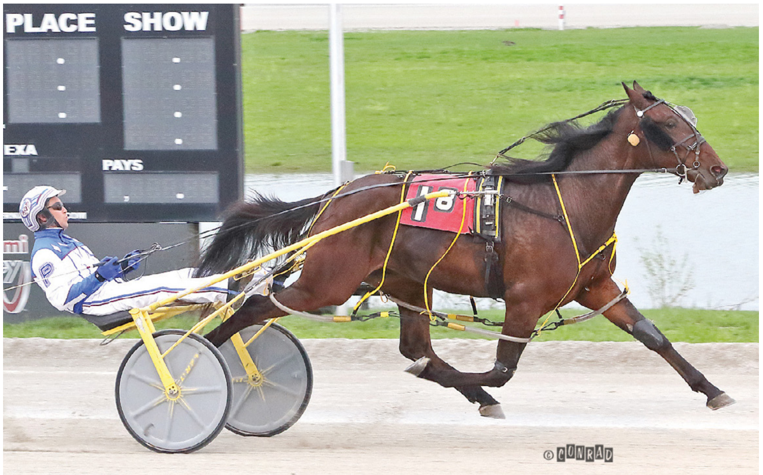
Sea Silk

Two of last year's divisional winners wasted no time as they set out to try and repeat as Ohio champions. Two-year-old filly trotting champion Gabbys C Note and pacing champion Sea Silk were easy winners in the first leg of the Ohio Sires Stakes at Miami Valley on May 1.