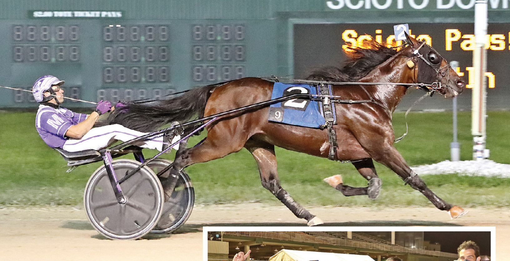
Action Uncle 2020 Ohio Horse of the Year