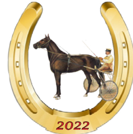
Night of Champions