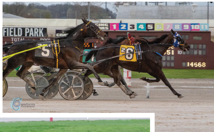
Winning Shadow