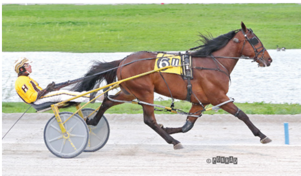
Barry's Berries

The win was Caviar Gold's second in three starts this year. He finished second in the other. With the win, Caviar Gold pushed his lifetime earnings to $146,500.