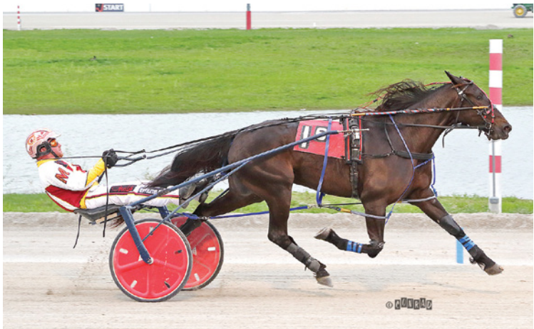
Gabbys C Note

ered the half in :58.3 and the three-quarters in 1:27 and pulled away down the stretch to win in 1:55.2.