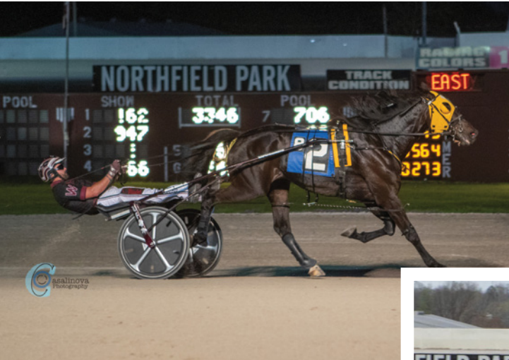
Smoking Jet