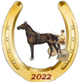
Night of Champions