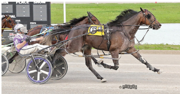
Fearful Intent