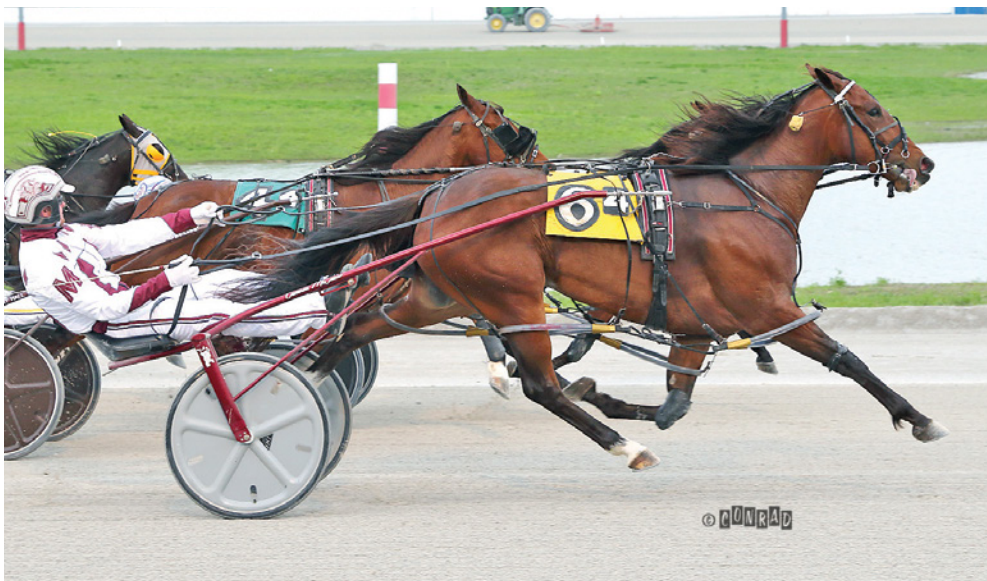
Secret Side Piece