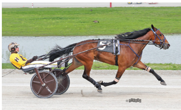
Kirsi Dream

A total of eight Sires Stakes races went to the gate in leg one, with each carrying a purse of $55,000.