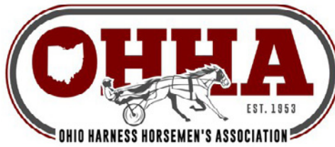
Dan Patch Awards