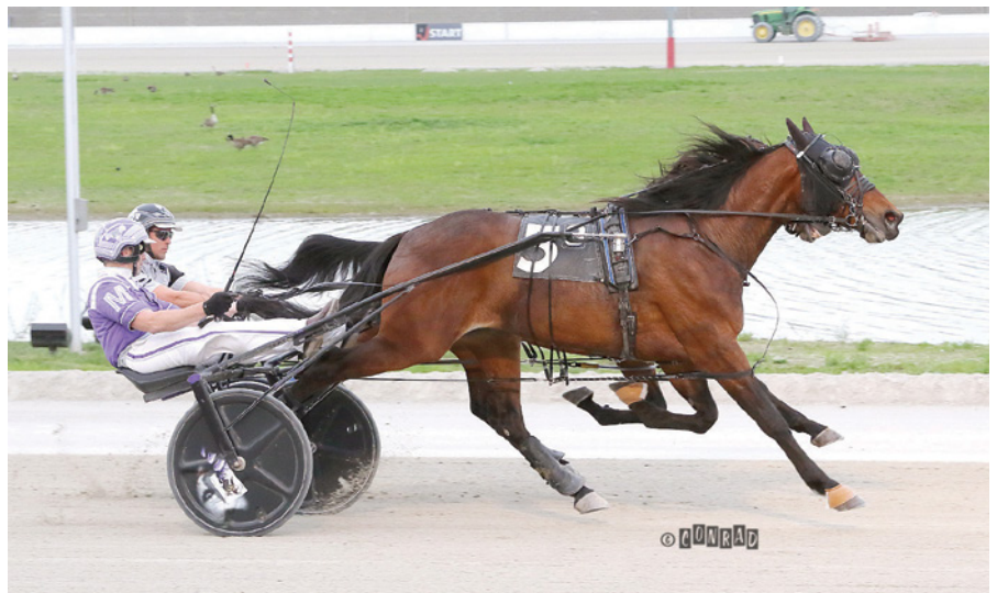
Surgeonemoretime