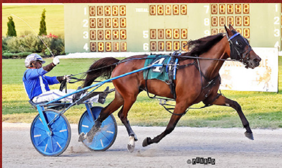
SUGAR INSTEAD 2-Year-Old Filly Trotting Champion