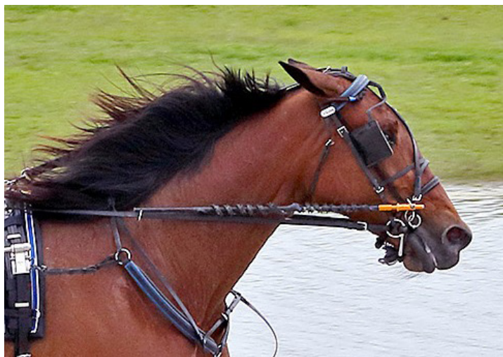
Rose Run Yolanda

Ohio Sires Stakes champion Rose Run Yolanda was one of two Ohio-connected horses in the 3-year-old filly trot.