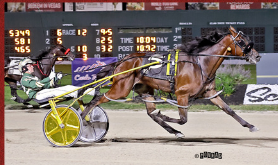
WICKED CHARACTER 3-Year-Old Colt Pacing Champion