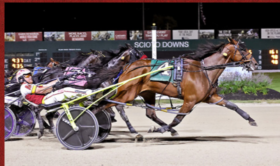
TARAPASTA 3-Year-Old Filly Pacing Champion