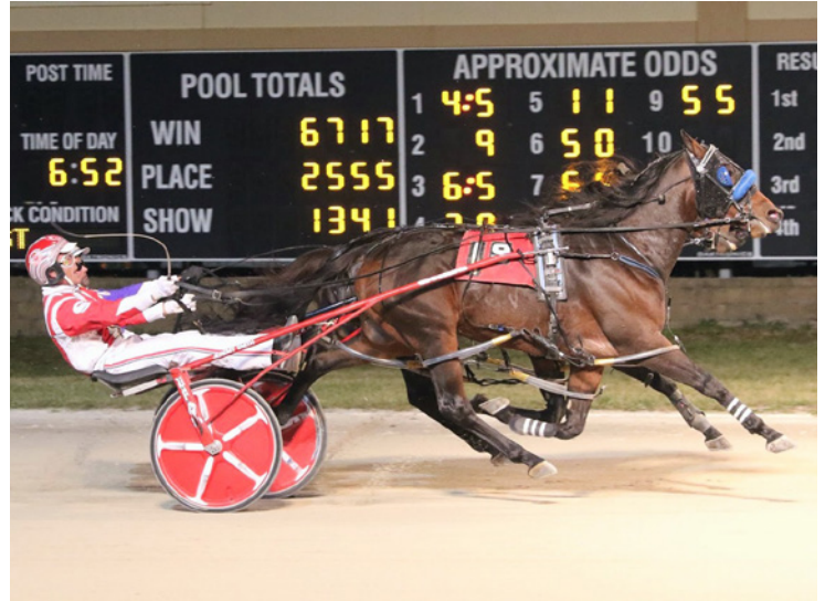
Ants Marching