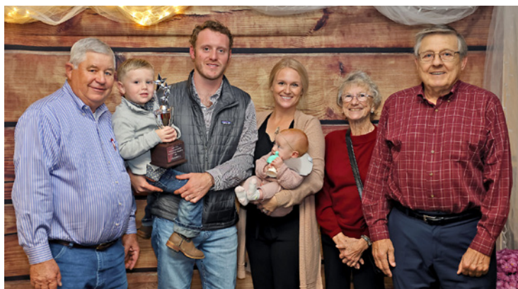
Team Le Van received the trophy for the top 3-year-old colt pacer Trooper L.