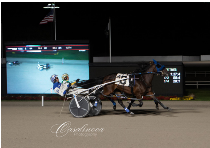
Lady Bridgerton