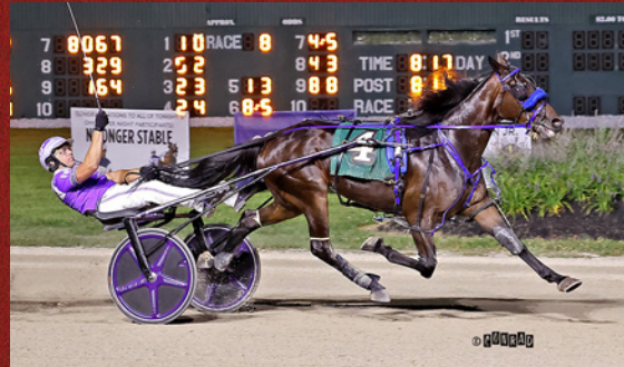
GRAND REVIVAL 3-Year-Old Colt Trotting Champion