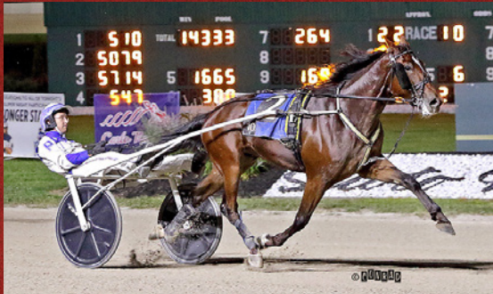
TENNESSEE TOM 2-Year-Old Colt Trotting Champion