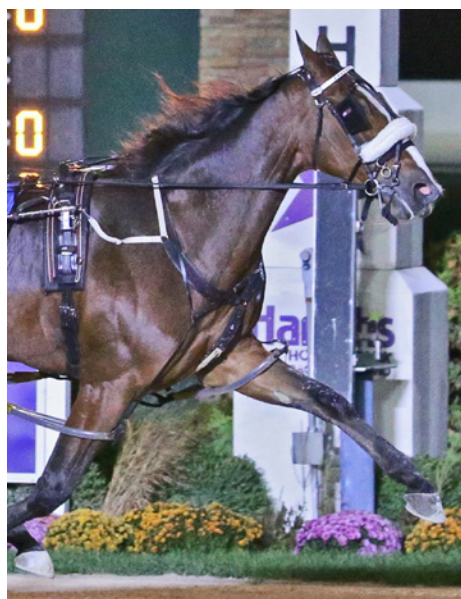
Geocentric