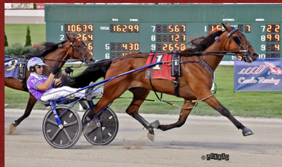
ROSE RUN YOLANDA 3-Year-Old Filly Trotting Champion