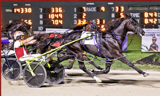
CLEVER CODY 2-Year-Old Colt Pacing Champion