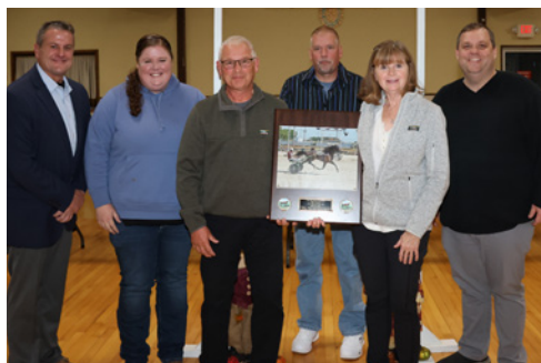
The trophy for three-year-old filly trot champion went to Hydraulic Hazel.