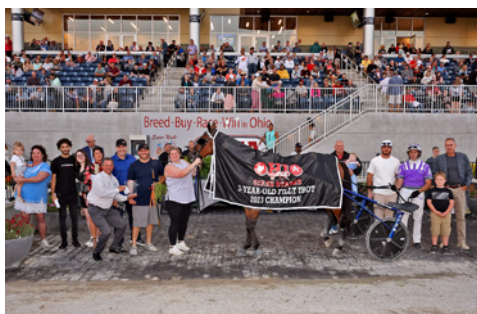
Rose Run Yolanda