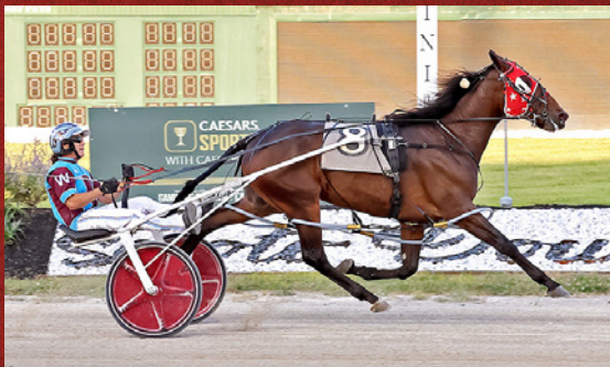
DAISY'S STAR 2-Year-Old Filly Pacing Champion