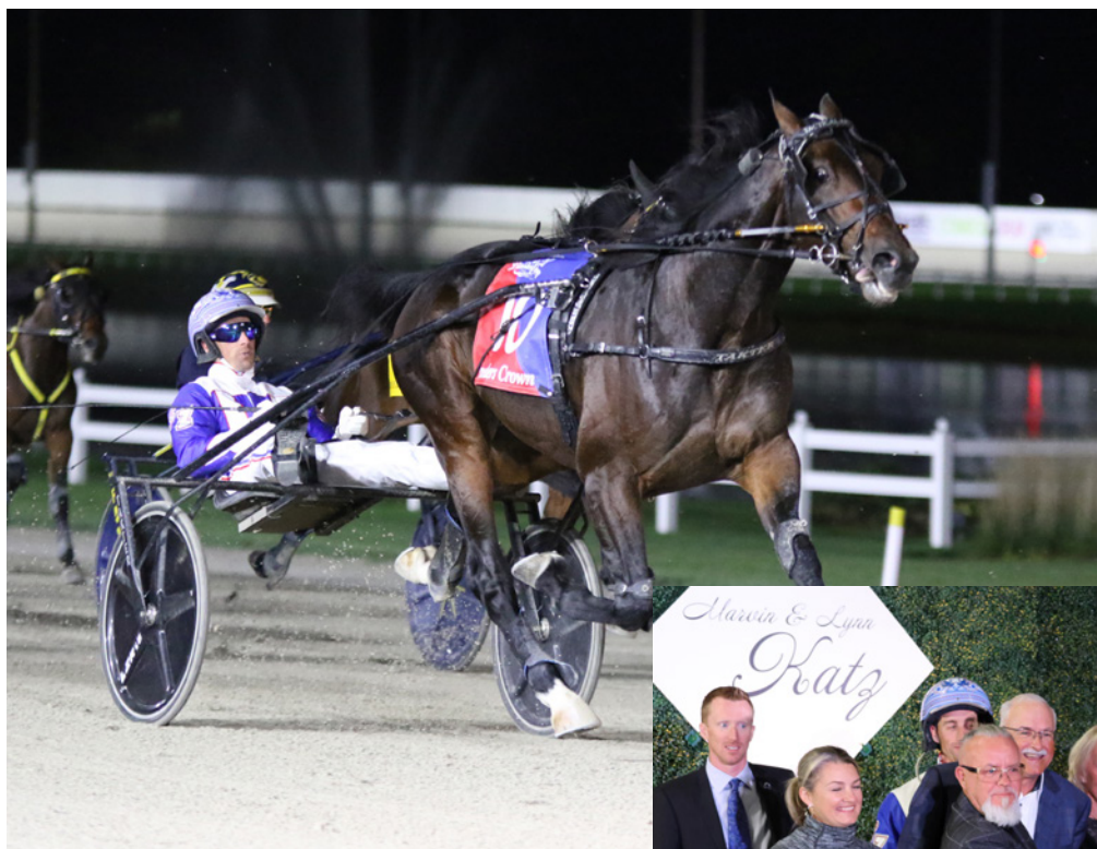
Tactical Approach