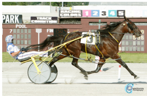
Sea Silk

The division has been dominated by Sea Silk. The daughter of Downbytheseaside has won all four legs in Sires Stakes action on her way to eight wins this year. She has hit the board in seven of eight starts, with the only blemish a seventh-place finish in the Fan Hanover at Woodbine in June. The other win on Sea Silk's card was in the Ohio State Fair Stakes.