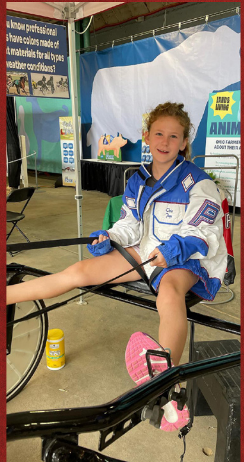
New fans stopped by the OHHA tent