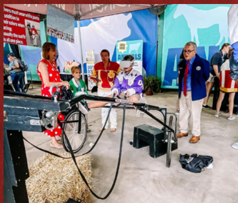
Governor Mike Dewine and his grandchildren stopped by the booth