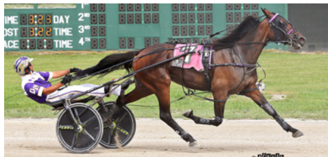
Lady Is Great