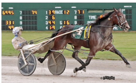
Bythemissal

Bythemissal is the cream of the crop in the division. The Downbytheseaside gelding has won the three legs that he was entered in. Bythemissal did not race in the third leg. He has hit the board in all ten starts winning eight of them. Among the eight wins are the Adios and the Carl Millstein Memorial where he tied the world record. Gulf Shores,