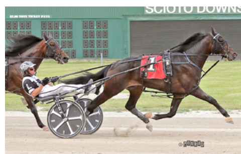
Longshot

The winners of the last two legs, Longshot and Rose Run Xtra have set up a showdown in the Ohio Sires Stakes finals. Longshot, the winner of six of eleven races this year has three wins in Sires Stakes action while Rose Run Xtra has won two legs. Rose Run Xtra has hit the board in all 12 races this year and is 23 for 24 in his lifetime. The two have not met during the Sires Stakes. Longshot's only loss in the OSS came in the first leg when Caviar Gold won.