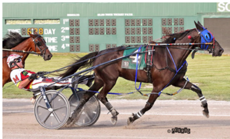
Gabbys C Note

The 2021 Two-Year-Old Trotting Filly of the Year in Ohio will look to repeat as champion. Gabbys C Note is on a roll having won five straight. This year she has won eight of ten and finished second twice. In her career she has won 13 of 17 races.