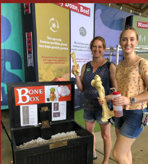
The Bone Box was a big hit