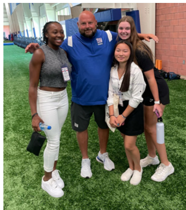
Workshop attendees attend New York Giants training camp and interviewed players and met Head Coach Brian Daboll.