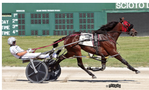
Fear of Sports