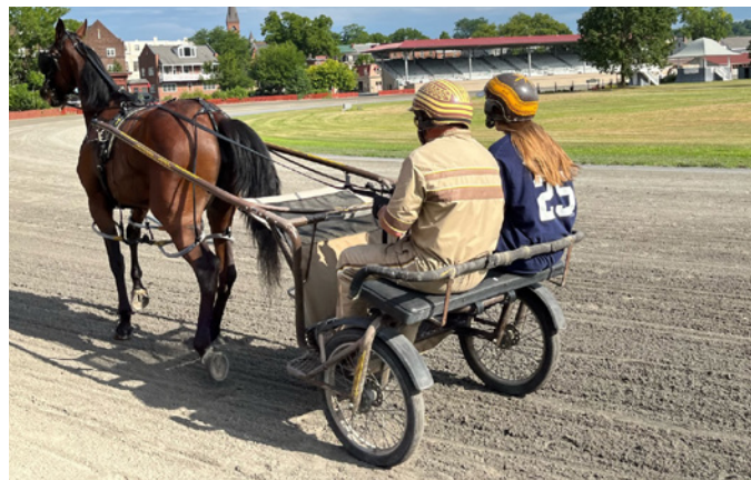
Getting to drive a racehorse