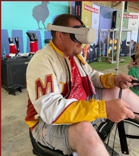
Even the big kids like the virtual reality race bike

The Ohio Harness Horsemen's Association was at the 2022 Ohio State Fair. Fairgoers got to ride the virtual reality race bike, try on driver's colors, wrap legs, and look in the bone box. All those that took a ride in the virtual reality bike left with a souvenir.