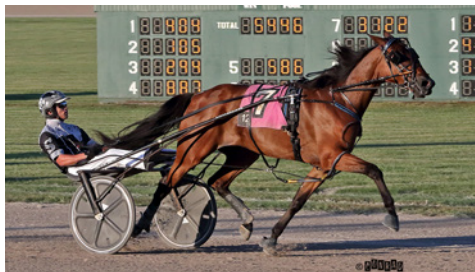
Rose Run Yolanda