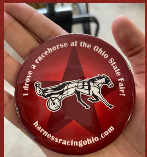
All those that took a ride on the virtual reality bike left with a souvenir