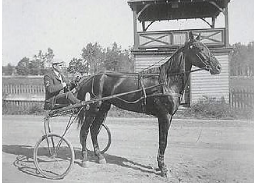
The bicycle sulky.