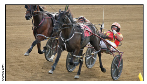
Multiple stakes placed 3YO and Ohio Sire Stakes Final Runner-up at 2 CARMEN OHIO

p,2,1:51.3; 3,1:49.3 ($1,452,418) Western Hanover-Daisy Harbor