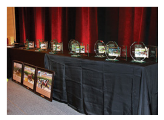
Banquet photography by Conrad Photo