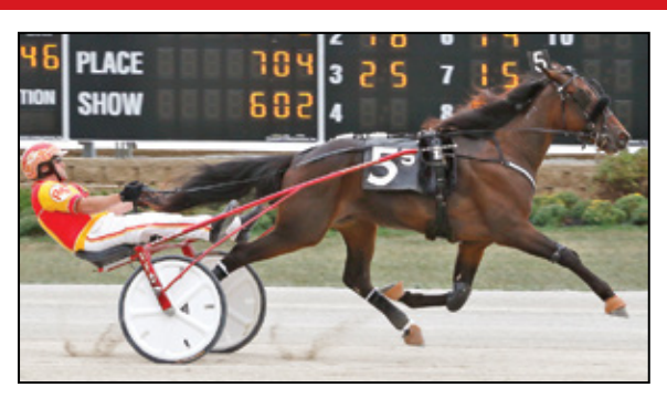
2019 Buckeye Stallion Series 2YOCT Championship Winner HERECOMESCHARLIE B

2,1:59f; 3,1:57.2f; 4,1:55.4f ($238,692) Striking Sahbra-Sibyl Score-Final Score