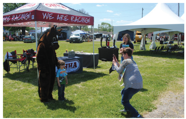
MAY 2021 • THE BUCKEYE HARNESS HORSEMAN 25