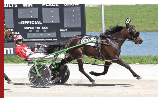
Pompatuse of Love

On Friday, 10 divisions of Ohio sired colts, seven divisions of pacers and three divisions of trotters, went postward for $17,500 in each race.