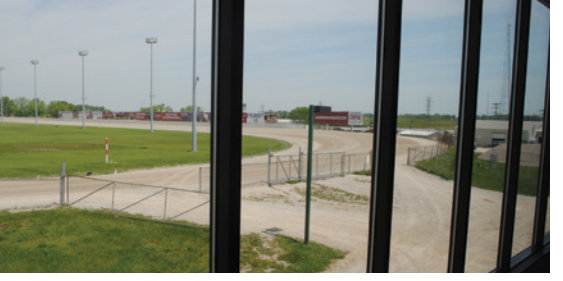
New windows were installed in driver's lounge

He is horseman friendly. It's nice to see them willing to spend money, not only for the patrons, but the horsemen."