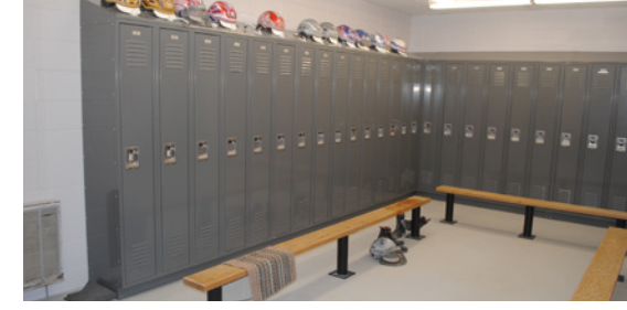
Improvements were made to the locker room.

Improvements also were made to the driver's locker room and lounge. Driver Chris Page appreciates the improvements.