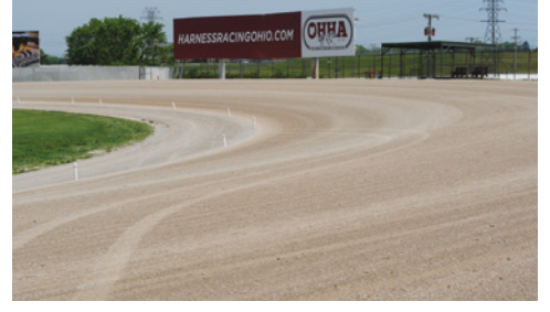
250 truckloads of material was added

"It is nice to see they are showing some effort to make it easier for the horsemen." Carter said. "When I first saw the concrete by the barns, I thought that would have