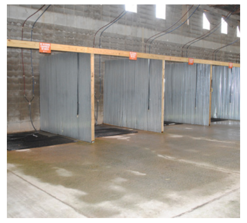
Paddock bath stalls

When the curtain was raised on the 2021 racing season at Eldorado Scioto Downs, horsemen and fans saw improvements to the facility benefiting both.