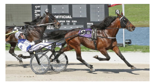
Mission Accepted