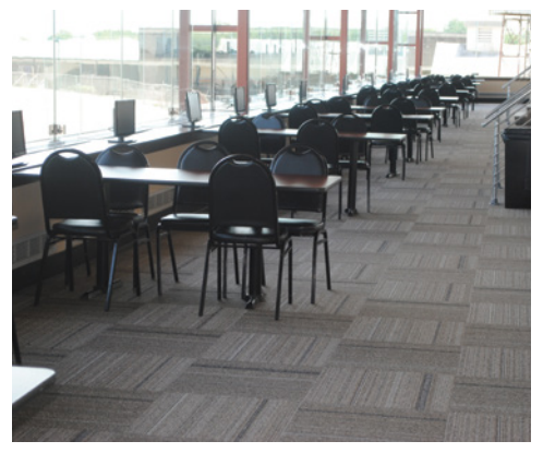
The clubhouse is looking sharp with new carpet.

Fans will also have more opportunities to place their bets with mutual machines becoming available on all levels.