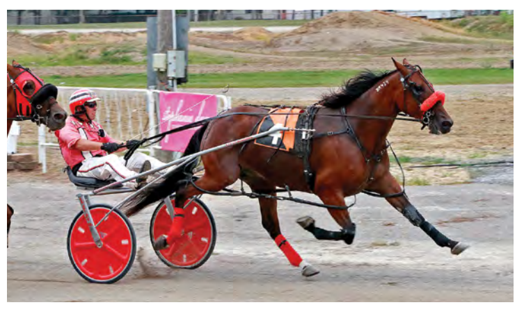
Sweet Oliver was the top OFRC point earner in 2020