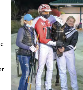
Kissin In The Sand's connections celebrating the victory

to the lead before the half-mile pole in 54.2. She fought off a charge by Warrawee Ubeaut around the final turn and had to hold off a hard-charging Shartin N down the stretch to win by a length.