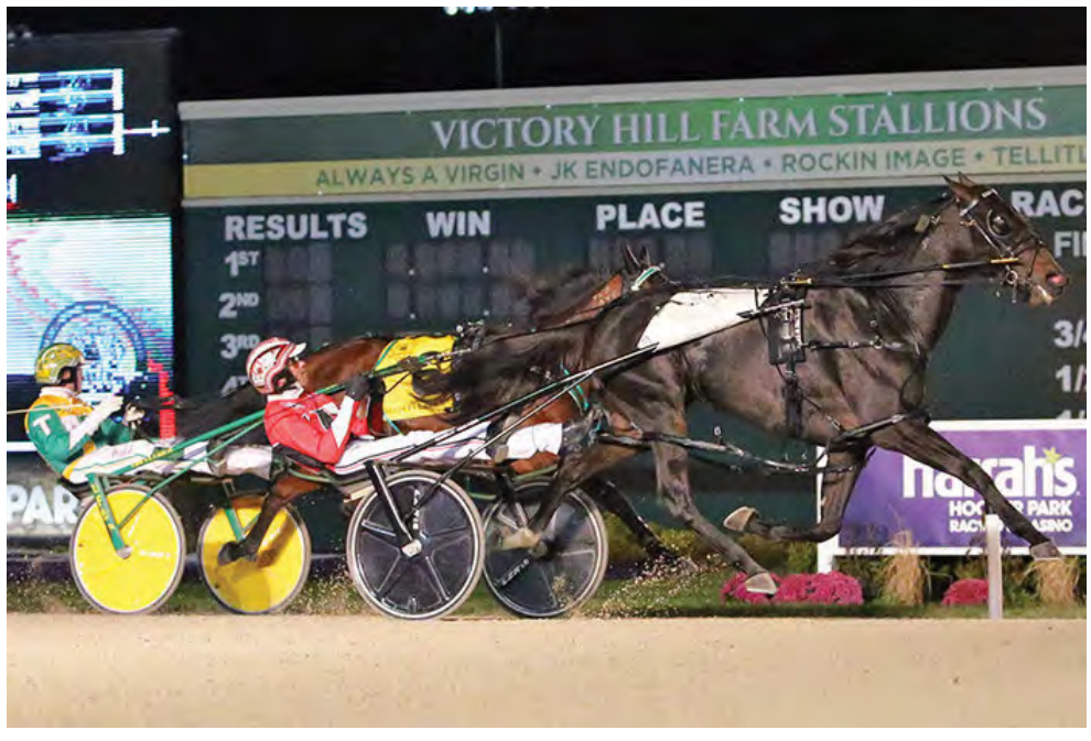
Kissin In The Sand wins the Breeders Crown