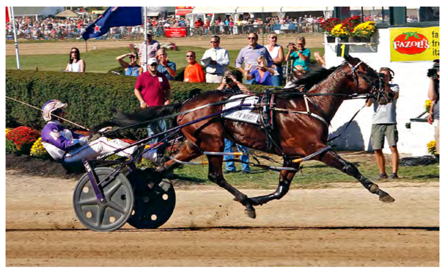
Lost For Words

Lost For Words, the 2015 Little Brown Jug runner-up is headed to Ireland where he will stand for the 2021 breeding season.