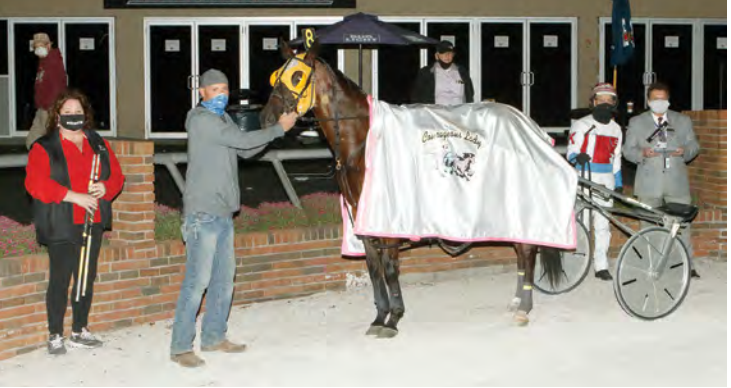
Drama Act