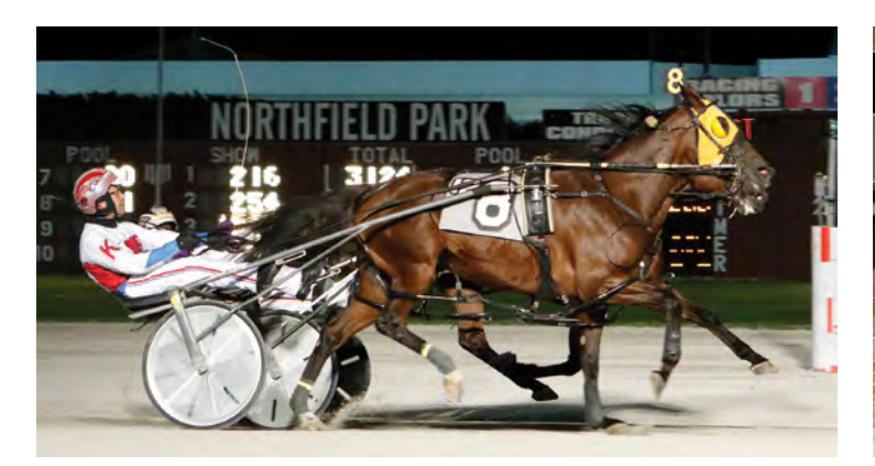
Drama Act wins the Courageous Lady at MGM Northfield Park

Drama Act overcame post-8 to prevail against Grand Circuit stock in the $120,000 Courageous Lady at MGM Northfield Park on Oct. 17.