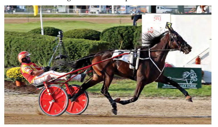
Designer Specs – OFRC Two-year-old filly trot champion

An undefeated two-year-old and a couple of repeat winners highlight the 2020 Ohio Racing Conference champions for 2020.