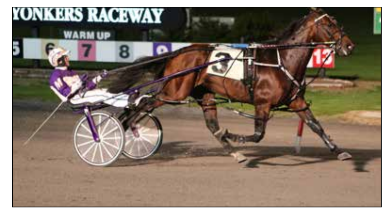
Downbytheseaside winning the Art Rooney. Photo submitted by Koehler II.

Seaside being Seaside. Photo submitted by Koehler II.