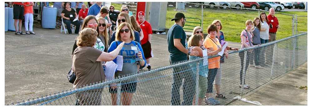
The charities enjoyed watching races even prior to their race.

Due to the generosity of Ohio horsemen, this has become an annual event that the OHHA looks forward to offering. Any charity interested in participating next year, send an email to <a href="mayhugh@ohha.com">rmayhugh@ohha.com</a> with your contact information or call the OHHA office at 614-221-3650.