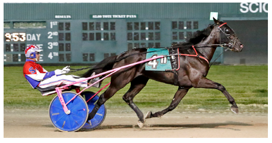
Workinitonbroadway on June 21 at Eldorado Scioto Downs