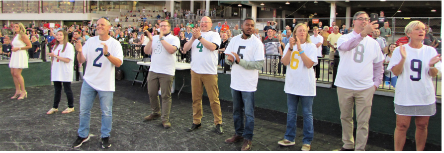
The excitement as the charities cheer on their horses.

of Central Ohio, Girls on the Run of Central Ohio, Haven House of Pickaway County Inc., JDRF Central Ohio, Mid-Ohio Foodbank, Ohio 4-H Youth Development, Ohio Farm Bureau Foundation, Ohio FFA Foundation Inc., Pacing For the Cure, PBJ Connections Inc., Pickaway County Special Olympics, St. Vincent dePaul Society- St. Denis/Holy Family/Immaculate, St. Patrick School, American Red Cross, Tread Lightly