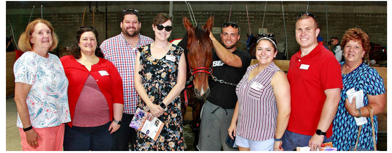
ALS met their horse Blooming Genius in the paddock

with Big Brothers Big Sisters for many years. This year he attended with Tread Lightly, a new charity to the event.