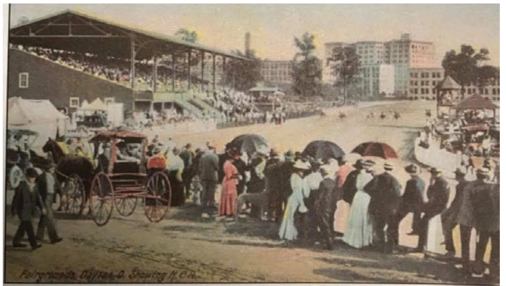
Fairgrounds, Dayton, Ohio Showing N.C.R. building (National Cash Register)

A 1925 view of harness racing at the Warren County Fair in Lebanon.