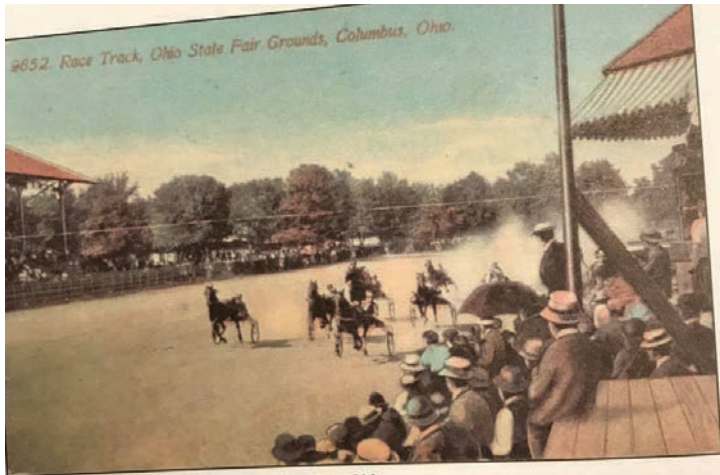
Race Track, Ohio State Fair Grounds - Columbus, Ohio

Postcard showing the Montgomery County Fair Grounds in Dayton, Ohio.