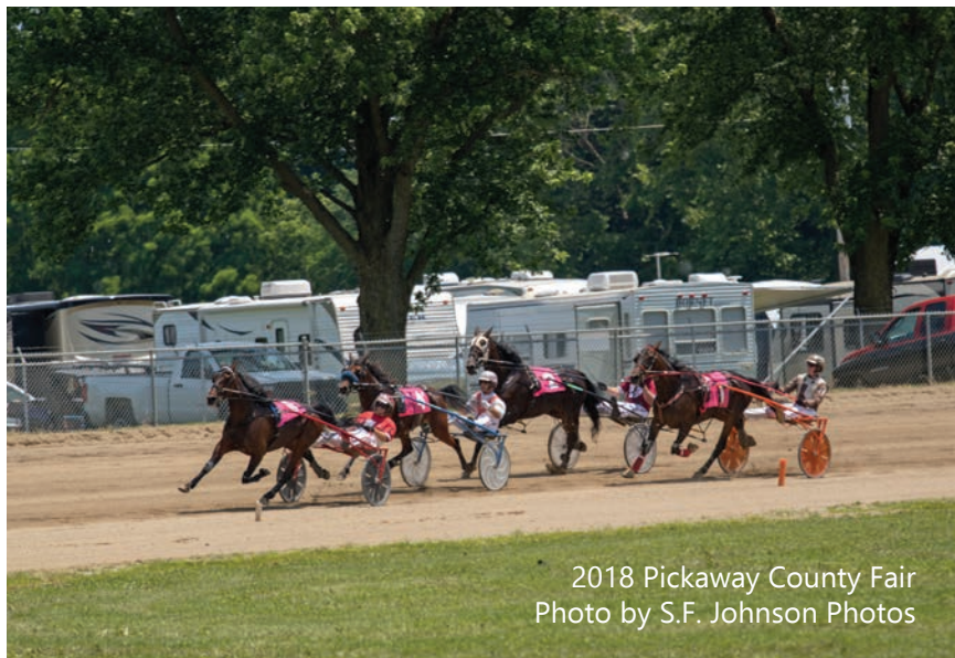
2018 Pickaway County Fair