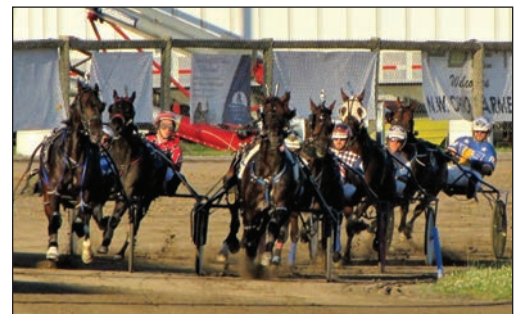
The Signature Series Pace comes off the last turn and heads for home.

And as the smiling crowd walked out of the Putnam grandstand saying their goodbyes, most of them added "see you next week at Marion."