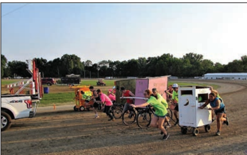
Pickaway County 4-H clubs participate in the annual Outhouse Race.