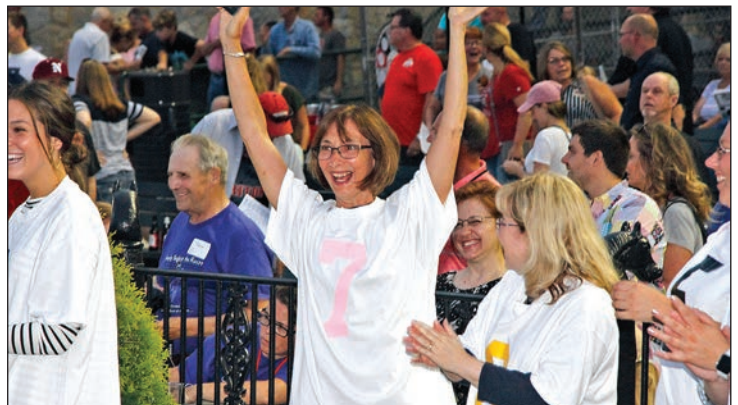
Charities stand in the winner's circle to cheer on their horse!