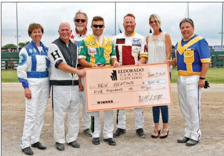
The winning New Vocation team.