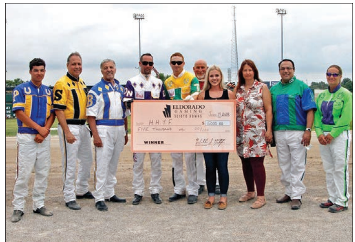
The team representing Harness Horse Youth Foundation.