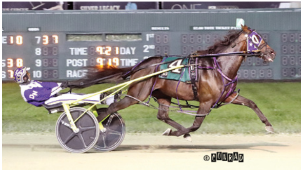
Ocean Rock