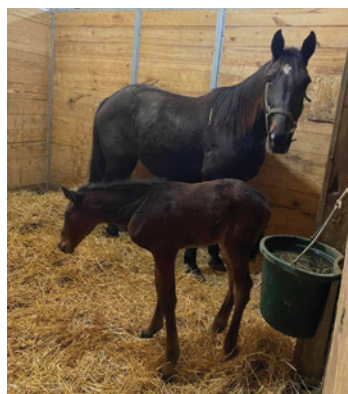
Sectionline Yankee with her Downbytheseaside filly

If things go as planned, Aquatic Yankee could have her daughter and granddaughter racing against each other in 2023.