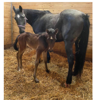
Aquatic Yankee with her Pet Rock filly