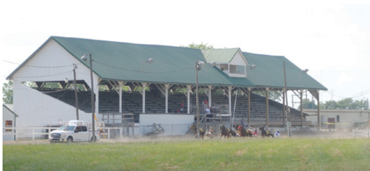
Grandstands were empty last year for harness racing

Ohio Governor Mike DeWine says he expects Ohio to have full county fairs in 2021 if health conditions are met. The announcement comes as the state's key numbers in the fight against COVID-19 continue to improve.