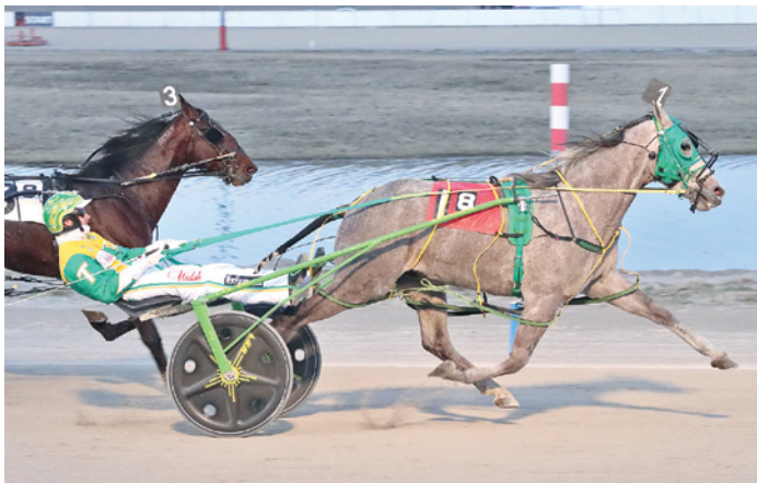
Hamsandwich wins at Miami Valley Racing.