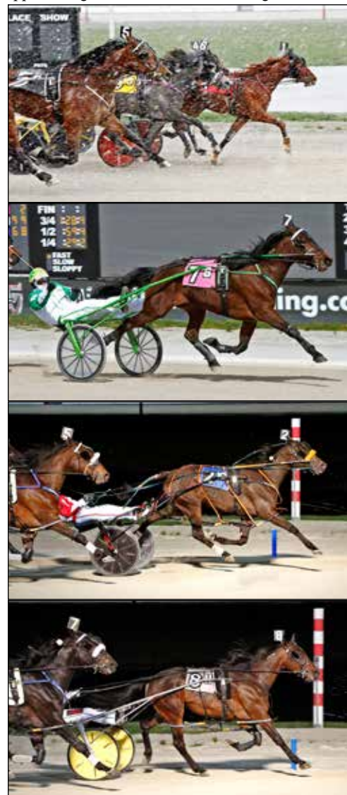
Top to bottom: Red Storm, Pass the Vape, Up Front Flor Ida and Sectionline Bigry.