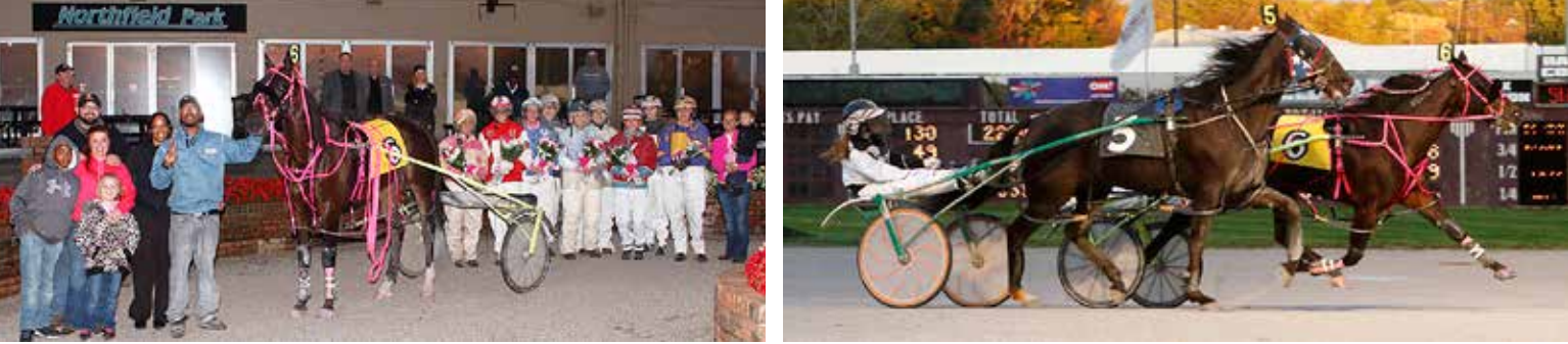
Northfield Park's Pace for the Cure, October 16, 2015, Photos by JJ Zamaiko.

November 27 will be the Courageous Lady at Northfield Park. The race is a Grand Circuit event for the top three year-old filly pacers in North America. The Northfield race office is also writing claiming series to be raced this winter.