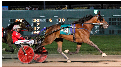
Rose Run Sydney 3FT