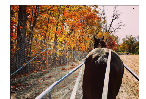
Cover photo: Fall 2016 with Stardust Memories on the backtrack at Northfield.