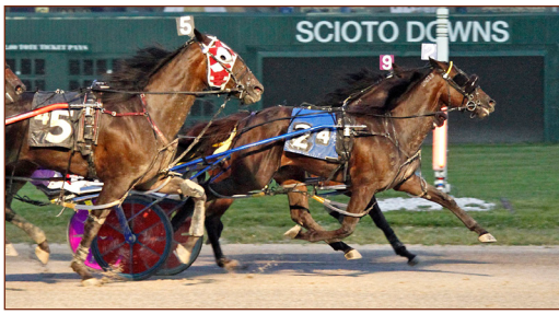
Seeing Eye Single 2CP