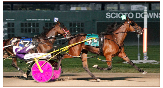
Bad Girls Rule 2FP