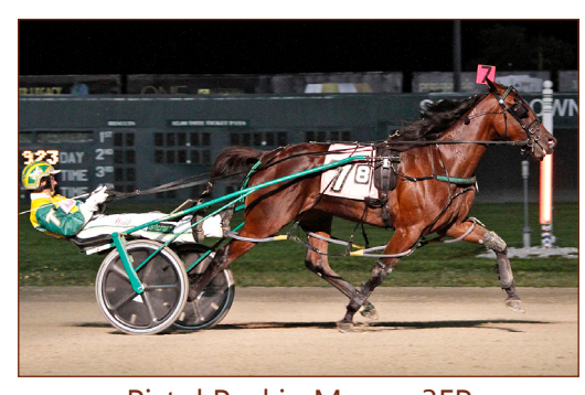
Pistol Packin Mama 3FP