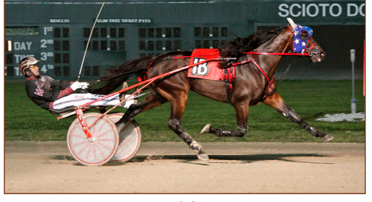
Fraser Ridge 3CT