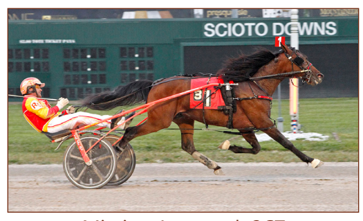
Mission Accepted 2CT