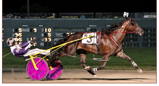
Drunk On Your Love 3CP