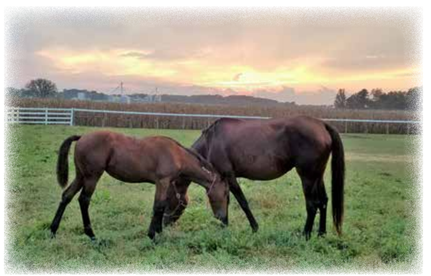
Kitty Kitty Bang with a Nob Hill High Filly.