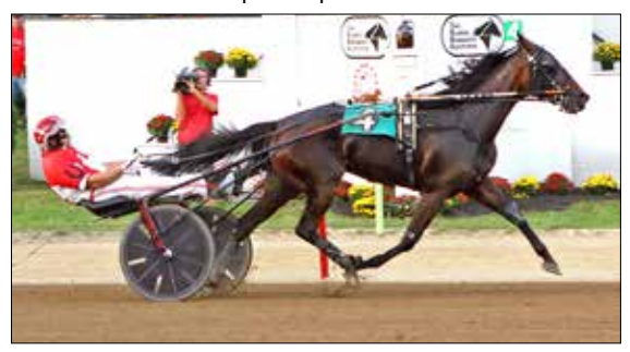
Impinktoo Ohio Breeders Championship 3FT