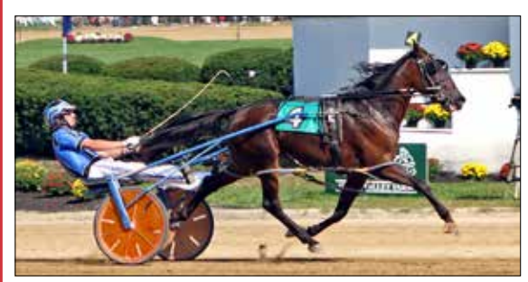
Officially My WayConrad Ohio Breeders Championship 2FP