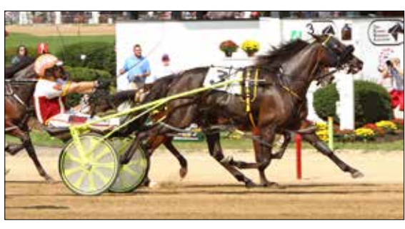
Dragonfly Standardbred Filly Pace

This year one of Ohio's own, Lather Up (I'm Gorgeous-Pocket Comb) won the 1st elimination in