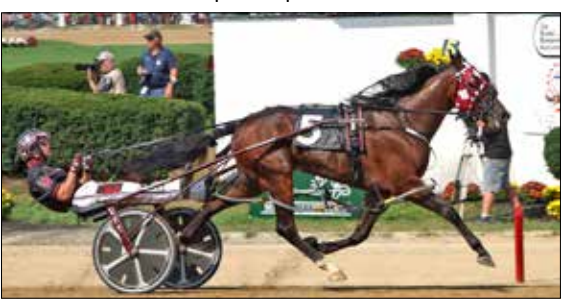
Rock Candy Ohio Breeders Championship 2FP