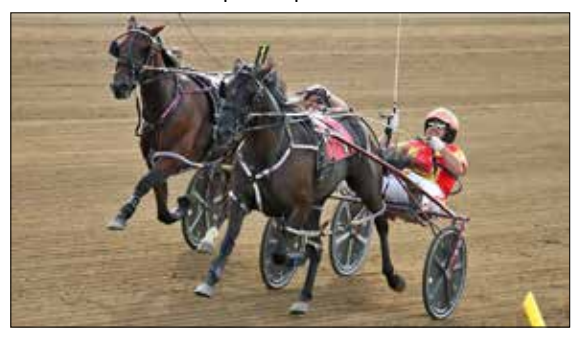
Carmen Ohio Ohio Breeders Championship 2FP