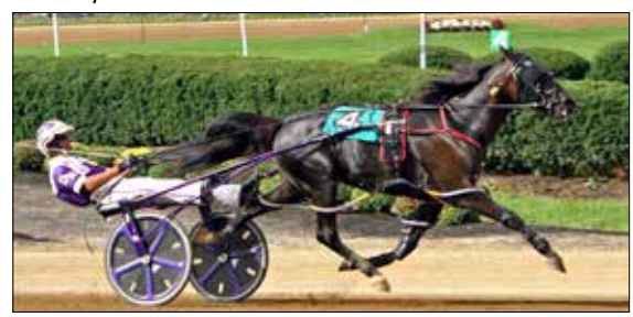
Dancin Dragon Buckeye Stallion Series 3CP Conrad Photo