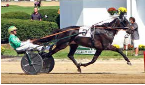
State of myhead As Ohio Breeders Championship 2FP