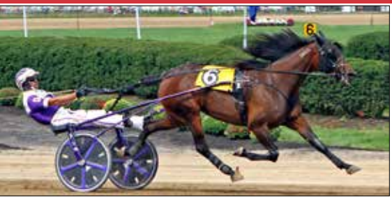
Infrontandforgetit Buckeye Stallion Series 3FT