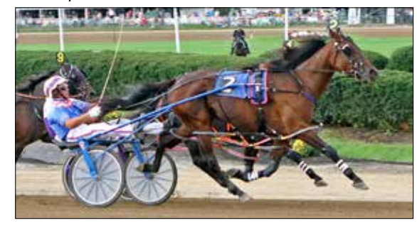
Our Miss Reese Buckeye Stallion Series 3FP