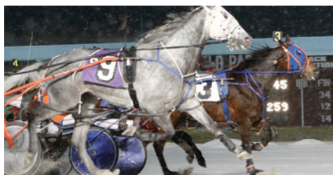
In his 499th start, Terror Of Thetrack wins for the 40th time

Fourteen-year-old Terror Of Thetrack has retired after making his 500th career start. The milestone start for the son of Western Terror came Dec. 21 at MGM Northfield Park.