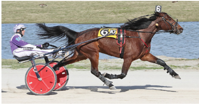
Kikimora