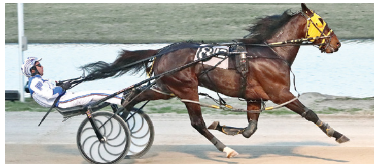
GD Western Joe