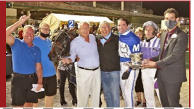
2020 Horse of the Year, Action Uncle

Join us to celebrate 2021 at the OHHA Annual Awards Banquet on Saturday, January 15, 2022 at the Hilton Polaris. The OHHA member meeting and First Lady's Luncheon are also planned that afternoon.