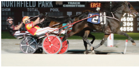
Designer Specs win for the 14th time this year in the fair finals

For the 14th time this season, Designer Specs ended the night in the winner's circle, as the two-year-old filly capped off her freshman campaign winning the Ohio Fair Championship at MGM Northfield Park Sept. 10.