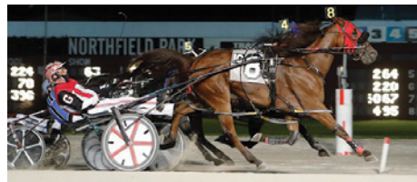
Rockin Daddy O, an 80-1 longshot wins the Ohio Fair Finals