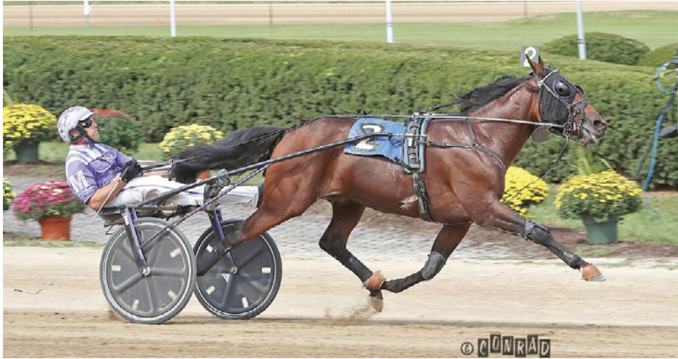
Action Uncle set a new world record in the three-year-old trot

It was a record-setting week at the Delaware County Fairgrounds for the Ohio Breeders Championships. Two world records, two stakes records and three track records were set while two more track records were equaled during the 18 OBC races.