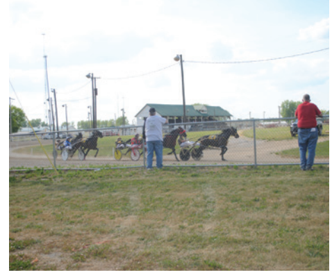
Social distancing in effect on the back side

Once the wings swing open on the starting gate, it looks like a typical Ohio county fair as the horses thunder into the first turn. But a look beyond the oval shows a different landscape for Ohio fairs in 2020.