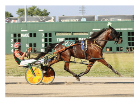
Medoland Bosa wins leg two of the BSS at Eldorado Scioto Downs