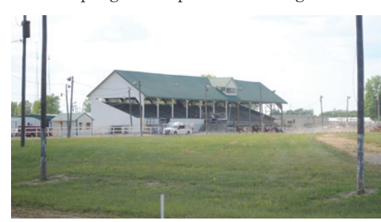
Racing at the Paulding County Fairgrounds

While fans will be allowed at Urbana, other fairs are opting for no spectators. Having