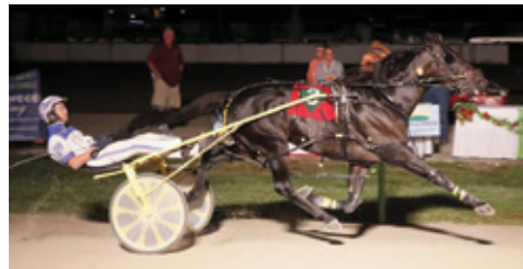
Bronx Seelster