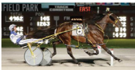
Sea Silk

Herculisa has now won ten times in 14 lifetime starts and has career earnings of $356,862.