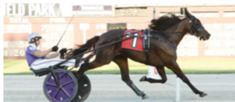
Herculisa

Two world records and four track records highlighted the Ohio Sire Stakes Championships at MGM Northfield Park September 5. Herculisa and Sea Silk set new world and track records while Smothastenesewisky and The Mighty Hill set new track records.