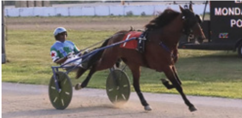
Street Gossip