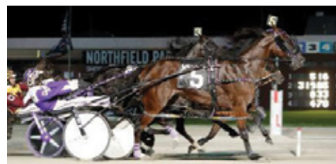
Borntobeshameless