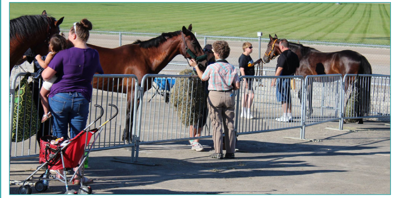
(Above) Back to the Track at Eldorado Scioto Downs with Ohio Standardbred and Friends.