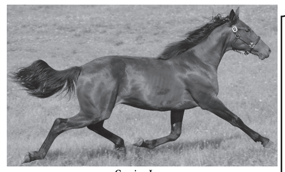
Cassius Lane Cash Hall - Winning Colors K

208 Cassius Lane Colt 5/16/16 Cash Hall - Winning Colors K \hbox{ Halfbrother toAutumn Escapade 2,2:ll:3h 3,1:55:1 1:52:3f \$911,121} Multiple stakes winner inc. Breeders Crown. Full brother to the top two-year-old in '17 Cash Lane p,2,1:56:2f $47,083 four starts and three stakes wins.