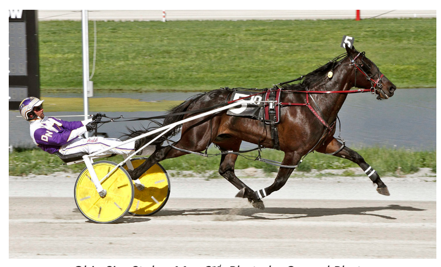
Ohio Sire Stakes May 2<sup>nd</sup>.

Best of Luck on the rest of the season to the connections of Drunk On Your Love!